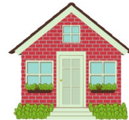
Ebenezer Avery House