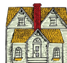
Avery Copp House