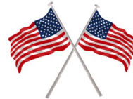
SUBVETS WWII National Memorial East