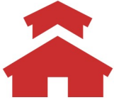
Nathan Hale School House