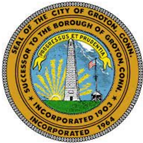
City of Groton