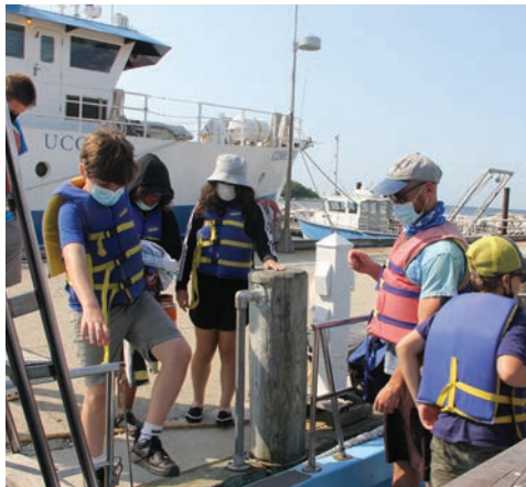
Students in one of the Project Oceanology summer camps board the vessel at the docks at UConn Avery Point in July.

The Thames River estuary is a major educational resource for Project Oceanology, a marine science and environmental education center located at Avery Point. Every year since it was founded in 1973, Project Oceanology has brought more than 20,000 students from elementary grades to college onto the Thames onboard Enviro-Lab. The students collect marine life, sample bottom sediments, measure water quality parameters and learn about the importance of preserving and protecting coastal water and the ocean.