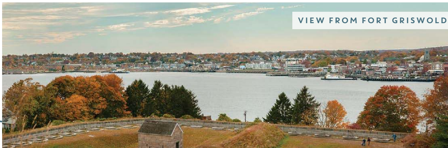
VIEW FROM FORT GRISWOLD